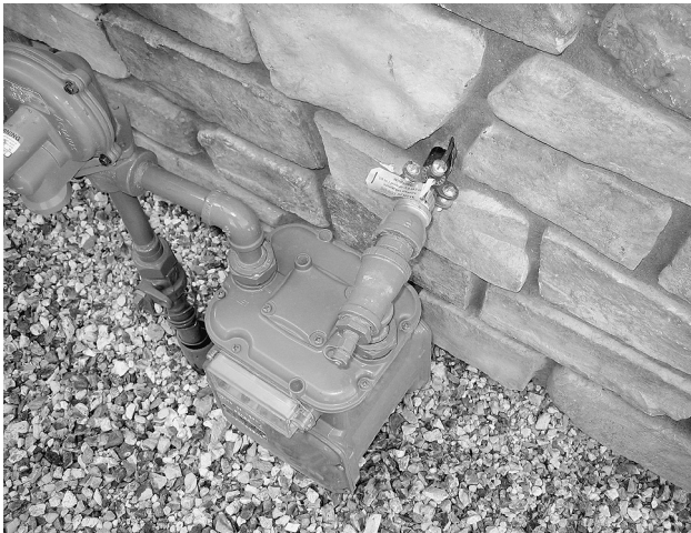
EXHIBIT S2.3 Location of Bonding Clamp.

be made downstream of the second-stage pressure regulator at the entrance to the building. The clamp can be installed either indoors or outdoors and the bonding jumper must be protected in accordance with the NEC , based on its size. The clamp must make metal-to-metal contact with the pipe or component. The corrugated stainless steel tubing portion of the gas piping system must not be used as